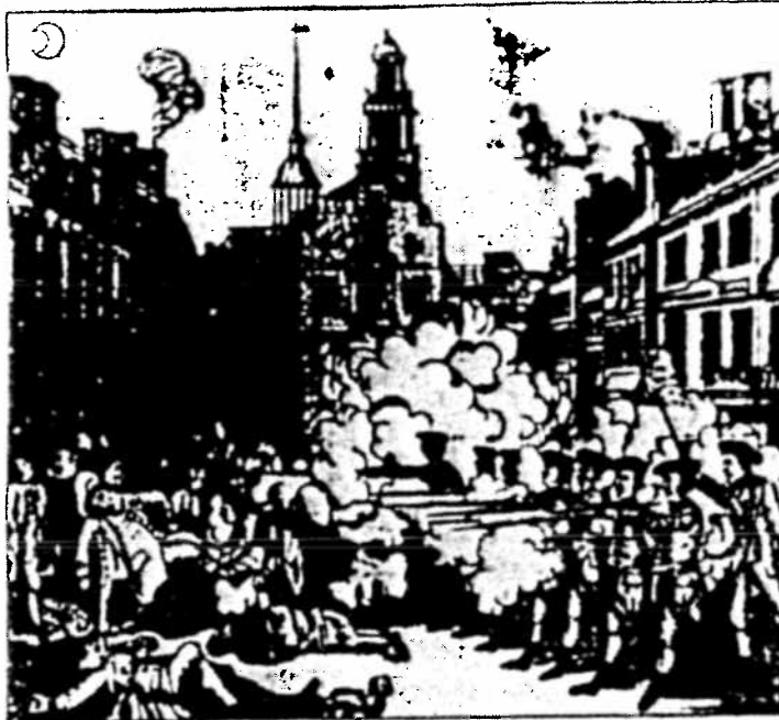
The Boston Massacre outraged American colonists. Many colonists formed their views of the event from Paul Revere's widely circulated cartoon.

One target of American outrage was customs collectors, whose job was to stop smugglers and collect taxes. They sometimes conducted searches under writs of assistance. These were general warrants that allowed them to search any house for smuggled goods. When customs officials in 1768 seized John Hancock's ship on charges of smuggling wine, Boston mobs attacked them.